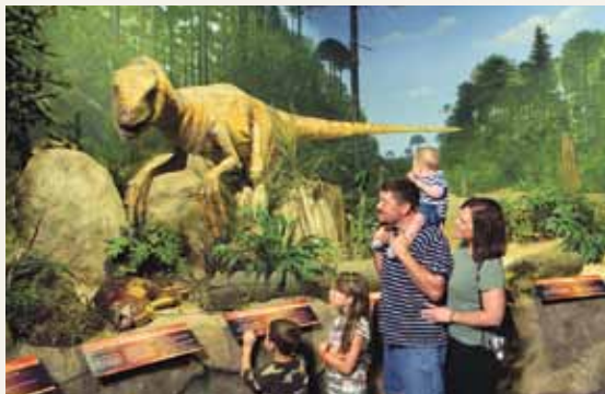
The state-of-the-art 70,000 square foot Creation Museum brings the pages of the Bible to life.